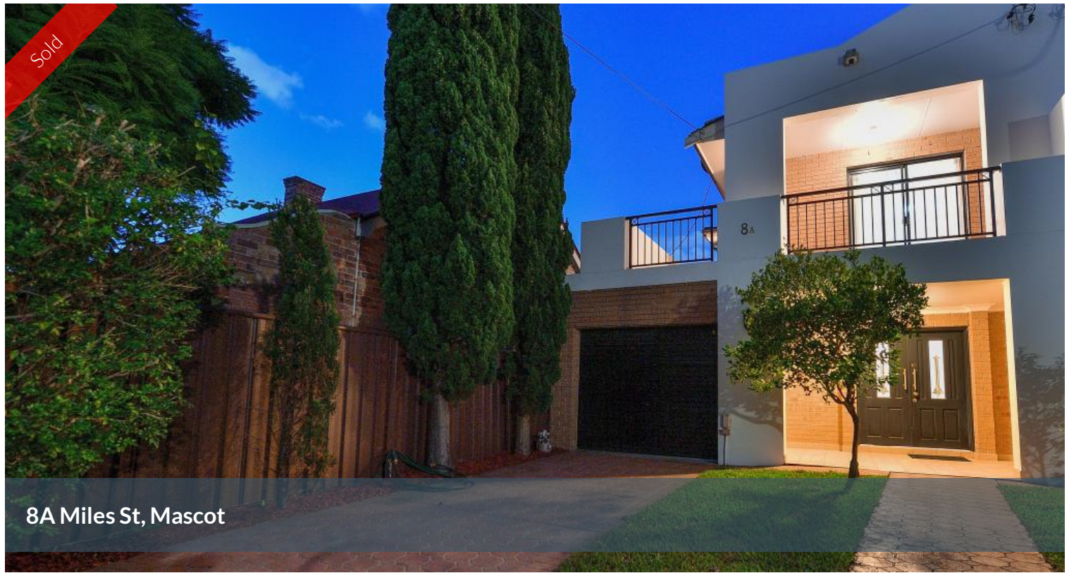
8A Miles St, Mascot