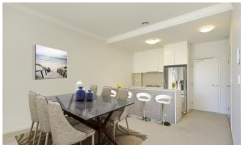
Unit 65, 3-17 Queen St, Campbelltown