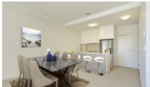
Unit 65, 3-17 Queen St, Campbelltown